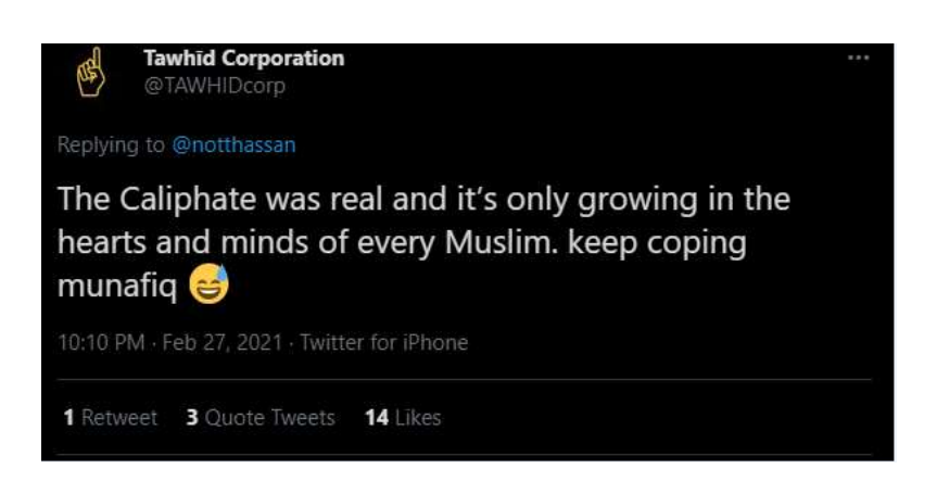
74. In another tweet posted on or about March 16, 2021, HASHIMI stated: