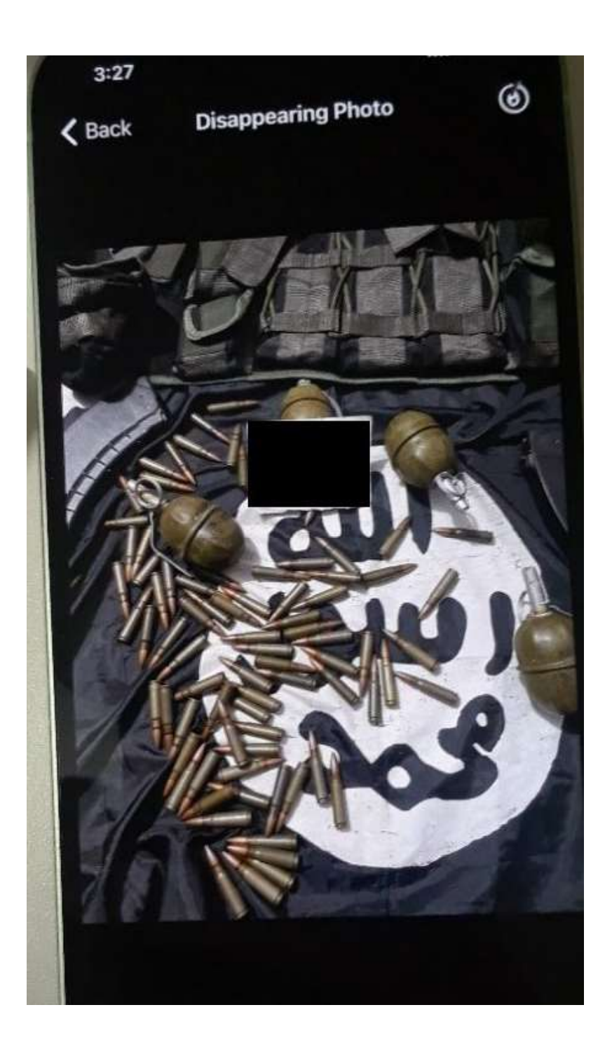
35. The photographs and video that Facilitator-1 sent depict tactical gear, ammunition, and grenades on top of an ISIS flag. The photographs and video also contained a